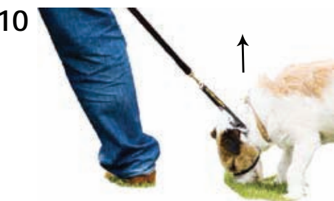
10 Keep your dogs head up to maintain focus