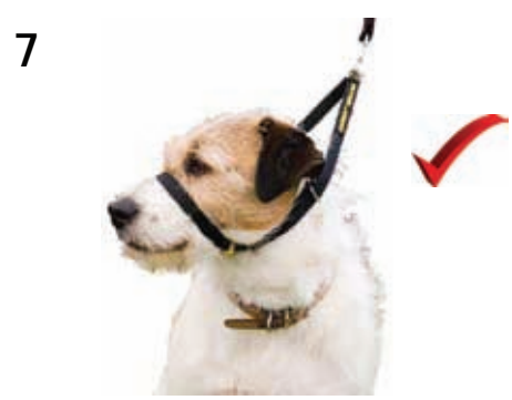
7 This is a correct fit