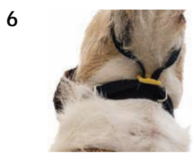
6 Yellow plastic guider should remain under chin