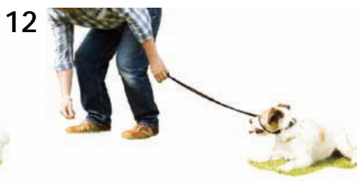
12 If your dog refuses to walk, lower your height to encourage and continue walking