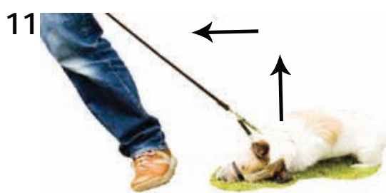
11 Some dogs resist initially. Continue walking and give praise