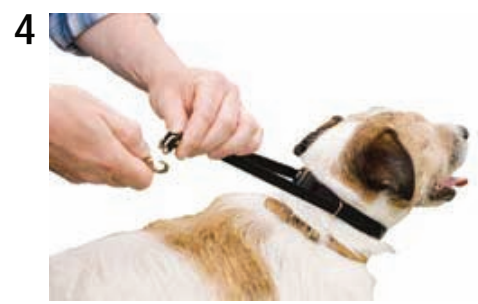
4 Attach leash to both 'D' rings of thin slip lines