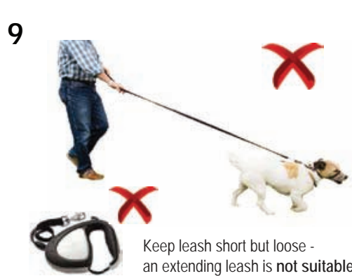
9 Keep leash short but loose - an extending leash is not suitable