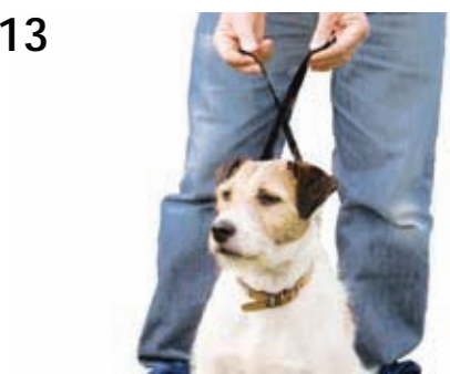
13 To use off leash, cross slip line behind head