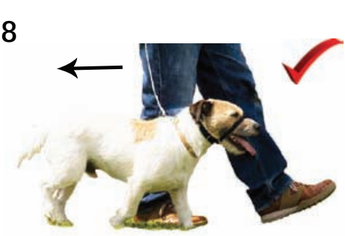
8 Apply gentle backward pressure to stop pulling