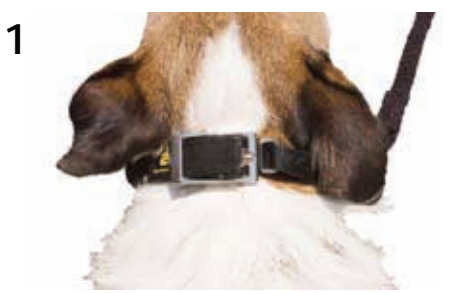
1 Fasten collar snugly with buckle behind head