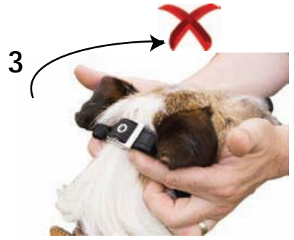
3 Check the collar cannot slip off