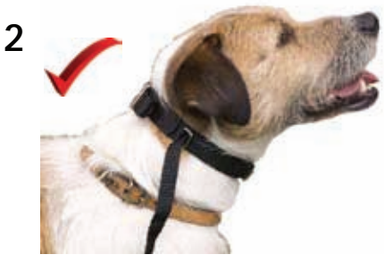
2 It should sit just behind the ears