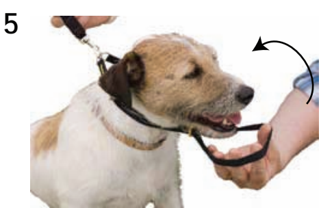
5 Pull slip line from under chin - place over nose